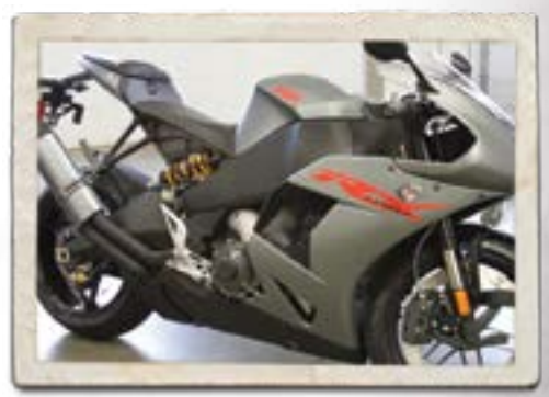
The Buell 1190RX, one of the new production models rolling off the line in East Troy.

Recovering from the abyss, Erik Buell Racing (EBR) is back in production. Under a new name, EBR Motorcycles, production started with 2016 1190RX and 1190SX motorcycles rolling off the assembly line March 17. The company was purchased by Liquid Asset Partners of Grand Rapids, Mich., and a solid financial plan is in place with a five- to 10-year vision. Although new partnerships for investors are available, it is not a critical part of the current plan. A priority will be making service and repair parts available to current