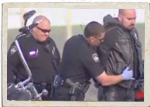
Motorcycle Profiling Project

Our department is here to serve and assist the entire community, which includes both business owners and their patrons. We are sometimes called upon to assist in situations that may arise at a business and in some cases to assist when a person is criminally trespassing. We also support the rights of people to peaceably assemble regardless of their appearance, clothing or affiliation with any group. Our downtown and our entire community welcome all law-abiding